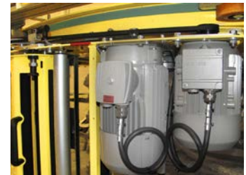
EPS: Electronic Pre-Stretch System