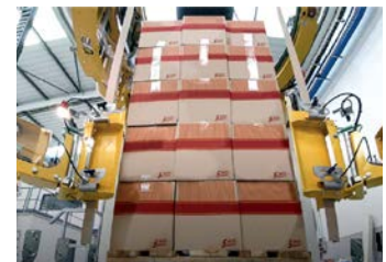
ACBA: Automatic Corner Board Application