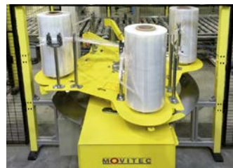
ARC: Automatic Reel Change