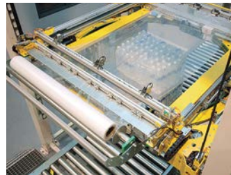
Dust-Proof & Rain-Proof Top Sheet Dispenser